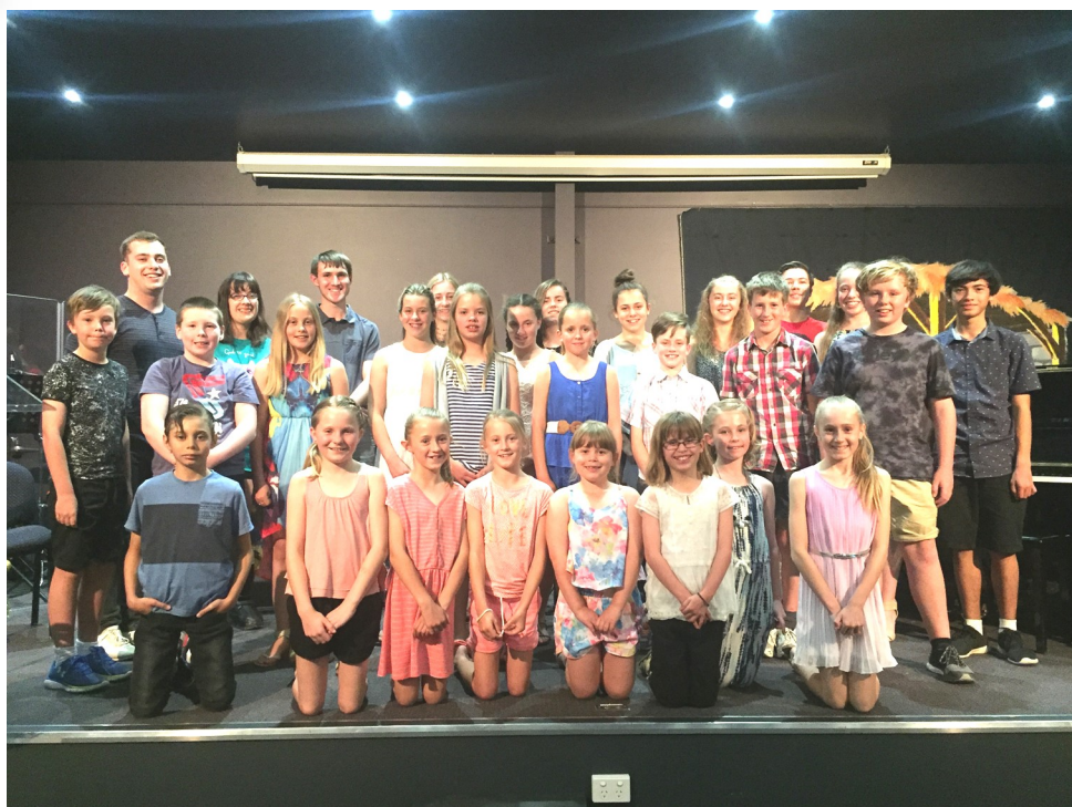
Students after their performance at one of our Recitals last Christmas